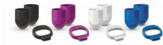
Welch Allyn Pocket LED Handle Bumpers and Otoscope Window Bumpers

Customise with our accessory kit* to mix and match your look.