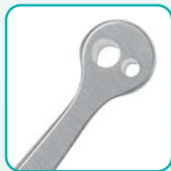
2.5mm and 1.6mm pin holes