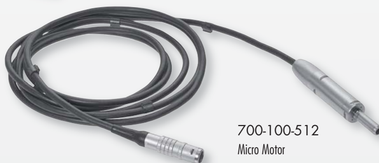
700-100-512 Micro Motor

Sterile Dermatome blades 50mm width 110-095-500