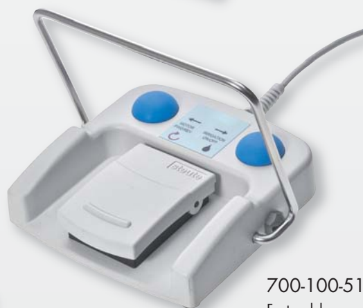
700-100-511 Foot pedal