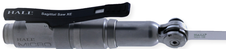
Hall ® MicroFree ® Sagittal Saw XE

Cut confidently with the MicroFree ® Sagittal Saw XE. Request an evaluation with your local Representative today!