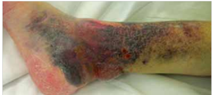
Intraoperative photo medial