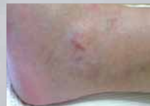
Minimally invasive approach using Acumed's Fibula Rod System reduces noticeable wounds during healing.