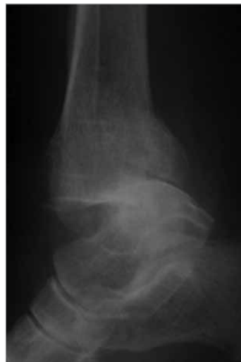
Pre-op x-ray M/L

Surgeon decided to use Acumed's Fibula Rod System due to swelling and blistering. Open reduction of the lateral malleolus could have resulted in wound complications. The medial side was also fixed using a minimally invasive approach (two lag screws).