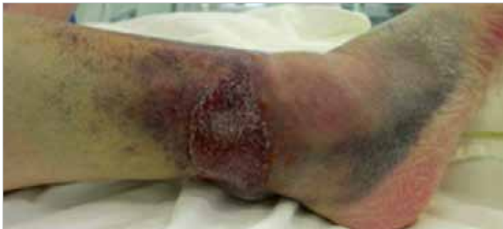
Intraoperative photo lateral

No significant past medical history, including no diabetic issues nor cardiovascular issues.