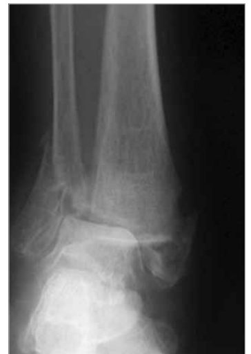
Pre-op x-ray A/P