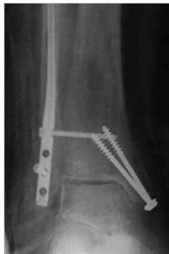
Post-op x-ray A/P