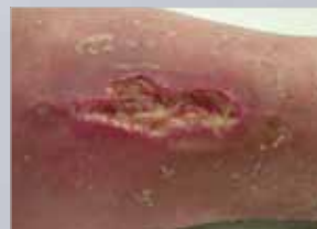
Infection due to distal fibula fracture.