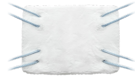
BioBrace® Reinforced Bioinductive Implant 23 mm x 30 mm