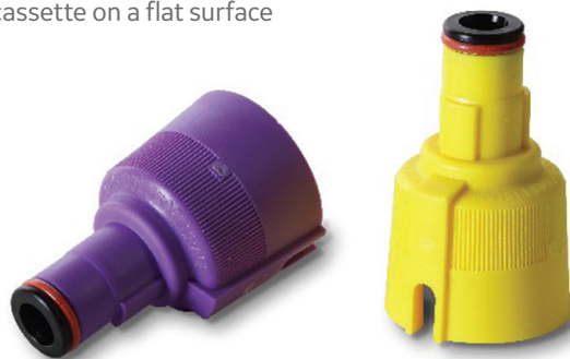
Easy-Fil bottle adapters