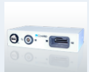
CABLE CONNECTOR INTERFACE

The autoclavable camera heads of the Looking Glass™ System provides a cost-effective process of sterilizing and turning around equipment between cases.