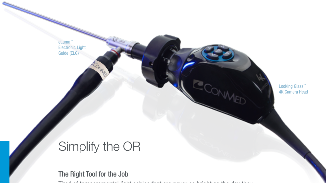
eLuma™ Electronic Light Guide (ELG)