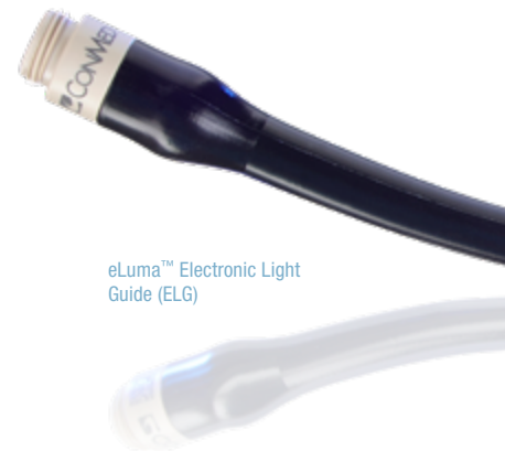
eLuma™ Electronic Light Guide (ELG)

With the ever-increasing demand for faster OR turnover, having circulators make tedious adjustments to imaging systems can seem like a big waste of valuable time. With CONMED's Looking Glass™ System, the 5-button camera head enables heightened control in the OR from the sterile field allowing you to navigate through the settings, menu, programming, and external device settings to make adjustments as required. These buttons can be easily customized to provide personalization of the functions as well. Additionally, the camera heads have been ergonomically designed to provide comfort when holding the camera head in various positions.