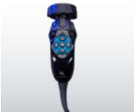
CAMERA HEAD 4K, 3-CMOS