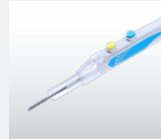
VISICLEAR ® SURGICAL SMOKE EVACUATOR