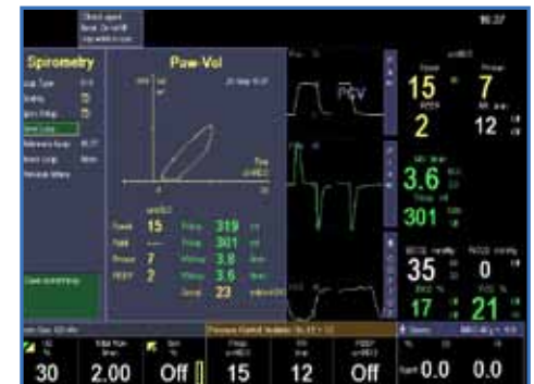
Spirometry Loop and Compliance Trending