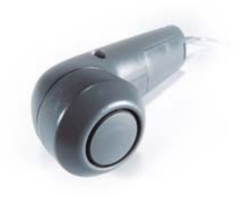
Corometrics' 9-Crystal transducer achieves a wider focal region for more uniform coverage at greater depths.