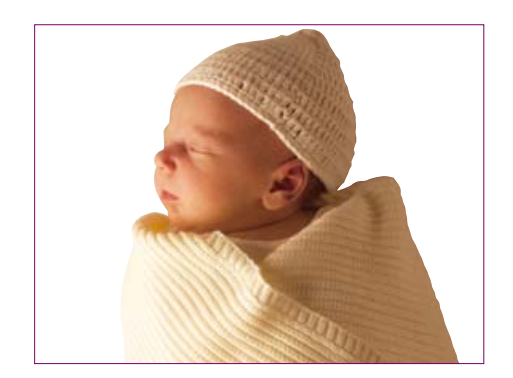
Corometrics 170 Series is your best partner from Antepartum through Intrapartum till Delivery.