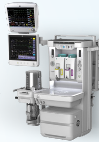
Wall mount system option (Carestation 650c)