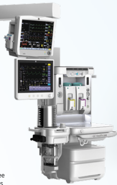
Pendant system option (Carestation 650c)