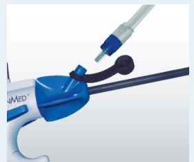
HOSE & LUERS