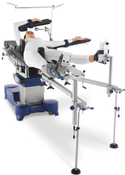
Femoral neck treatment in the supine position