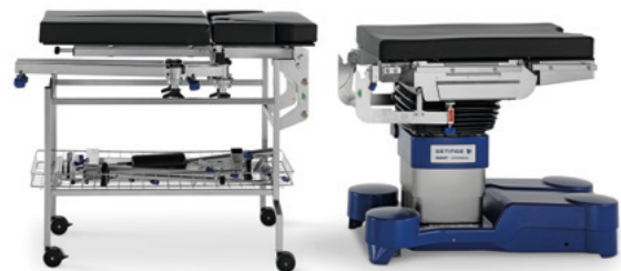
Mounting to the leg plate mounting point