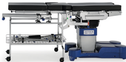
Trolley with basket and accessories