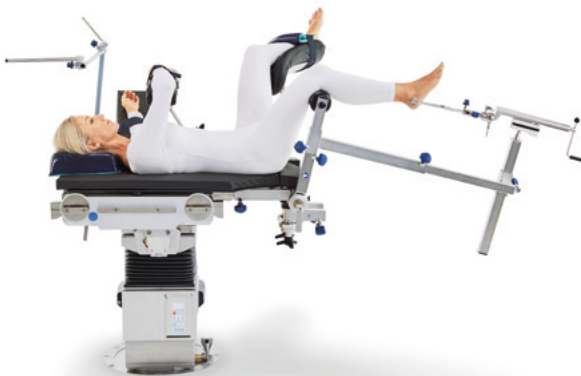
Tibia treatment with countertraction post for tibia and fibula and joint supporting arm