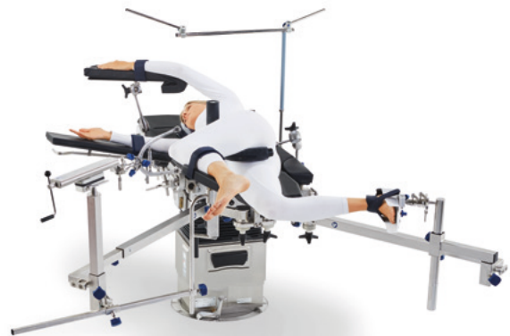
Femoral treatment in the lateral position