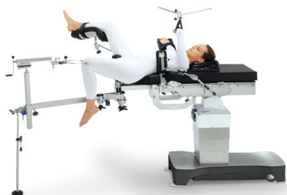
Femur treatment with traction stirrup clamp with rotation