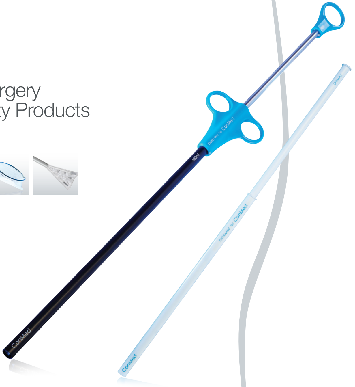
UNIVERSAL PLUS SUCTION/IRRIGATION