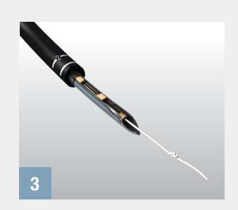
Reel in the suture until the knot sets against the first implant. Do not over tighten.

Learn more about the Sequent<sup>™</sup> Meniscal Repair Device and other innovative products. Call 800-237-0169 or visit linvatec.com.