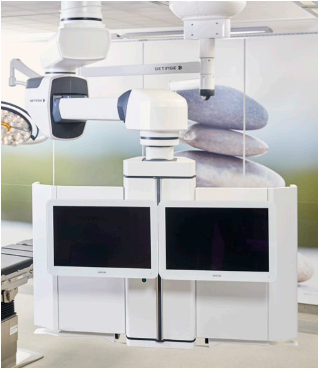
The EPoS allows the mounting of various accessories, e.g. dual flat screen holders as backup screens.