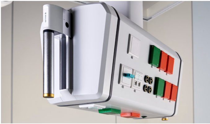
Three panels for outlets and sockets (including underneath).