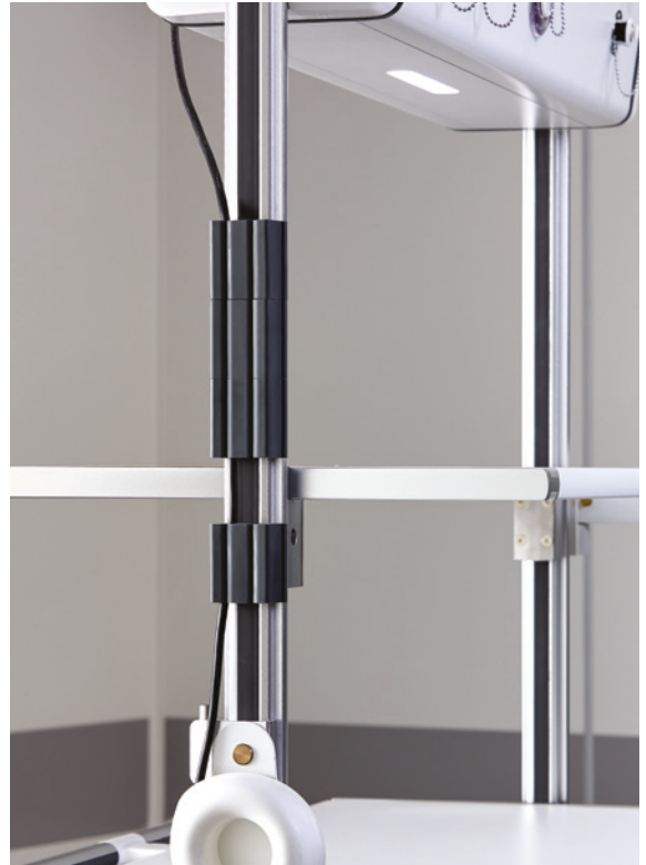
Smart cable management.