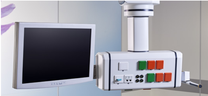
Full range of accessories available.