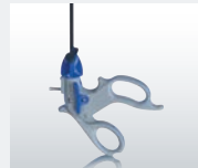
VCARE® UTERINE MANIPULATOR