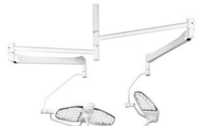
Dual Maquet Lucea 50/100 DF: ceiling version