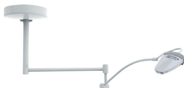
Maquet Lucea 40: ceiling version