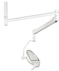
Maquet Lucea 50 DF: ceiling version