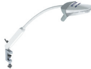
Maquet Lucea 10: rail version