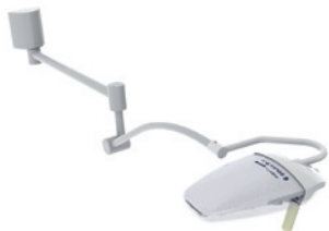
Maquet Lucea 50: wall version