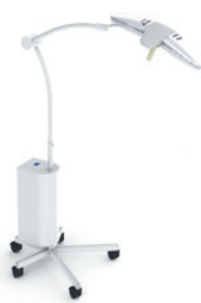
Maquet Lucea 100: mobile version with battery