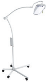
Maquet Lucea 50: mobile version