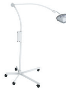
Maquet Lucea 40: mobile version