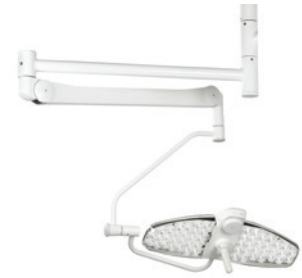
Maquet Lucea 100 DF: ceiling version