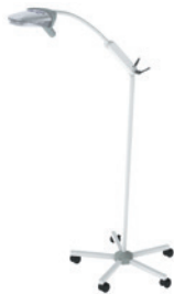
Maquet Lucea 10: mobile version