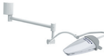
Maquet Lucea 40: wall version