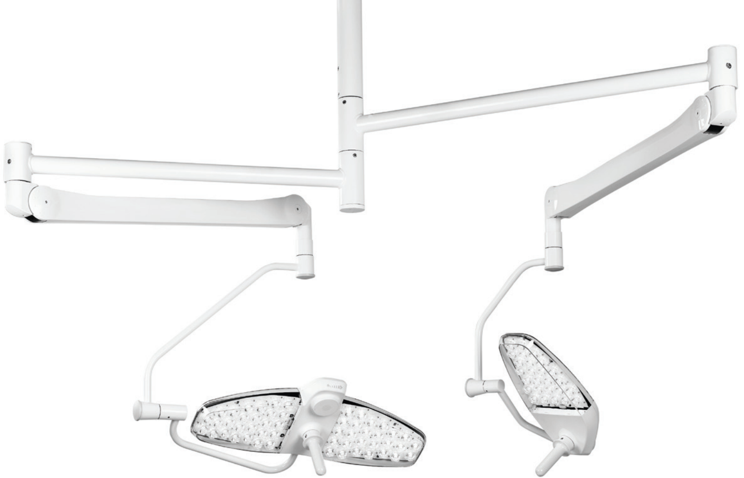
Maquet Lucea 100/50