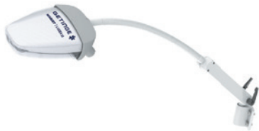
Maquet Lucea 10: wall version