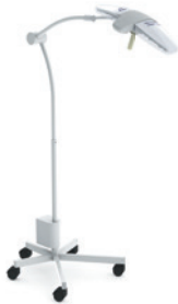
Maquet Lucea 100: mobile version