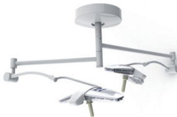
Dual Maquet Lucea 100: ceiling version