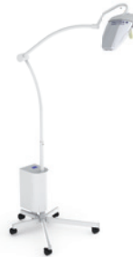
Maquet Lucea 50: mobile version with battery