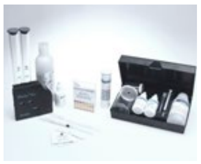
WATER TEST KIT