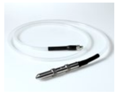
LUMEN MONITOR (FLEX)