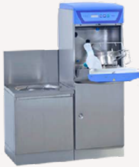
Care combination 900 mm, consisting of flusher disinfectant and a slop pail

Along with our flusher disinfectors, Arjo offers a range of sluice room elements such as cabinetry, shelving and sinks. These elements are designed as modular solutions, allowing a high degree of design flexibility and enabling you to change individual furniture components with ease in the future.