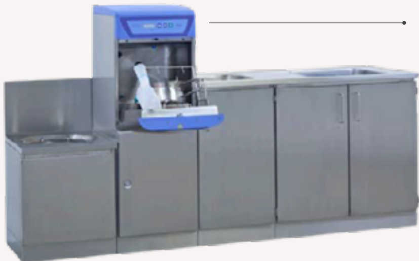
Care combination 2250 mm, consisting of flusher disinfectant, a 900 mm base cabinet with soaking basin, 450 mm base cabinet with hand basin and slop pail