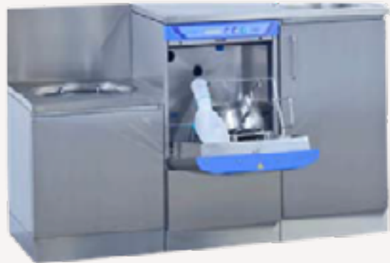
Care combination 1350 mm, consisting of flusher disinfectant, a 450 mm base cabinet with hand basin and slop pail