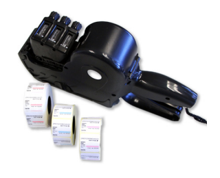
Getinge Assured Record Labels for Steam, EO & VHP