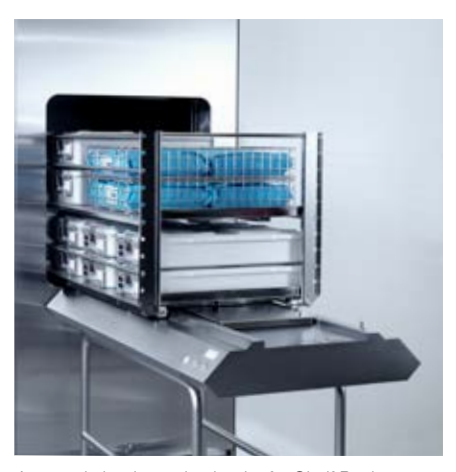
Automatic loader and unloader for Shelf Racks (GL64SR).

These are specially formulated to maximize the performance of your Getinge equipment. Getinge GSS67H is fully compatible with our Getinge Assured Bowie-Dick tests, which we recommend using with your new sterilizer.