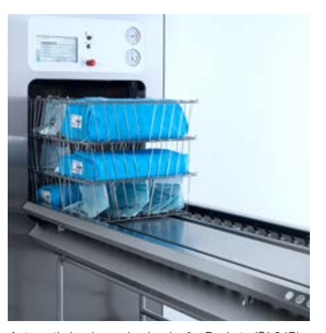
Automatic loader and unloader for Baskets (GL64B).