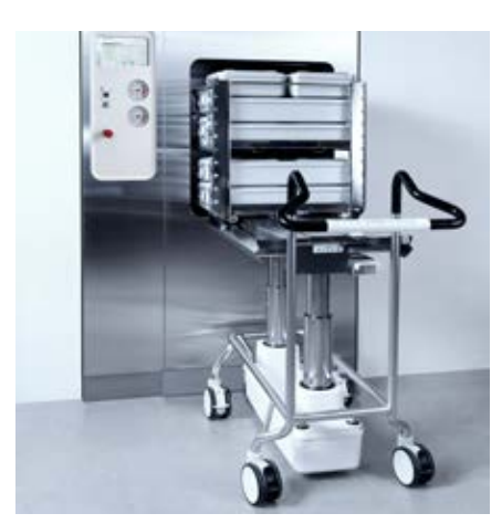
SMART loading/unloading trolleys.