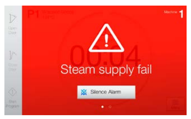
Every triggered alarm comes with clear onscreen directions for what action to take. No confusion, no stress, no time wasted.