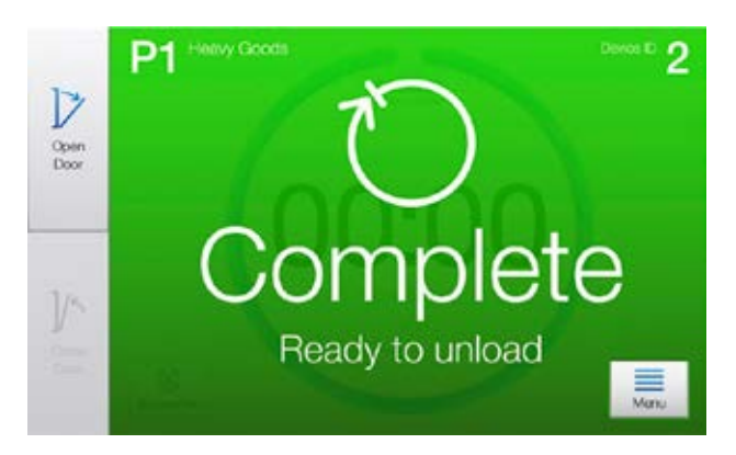
CENTRIC provides clear, uncluttered information – only what you normally need at any particular stage, nothing more.

The large, high-resolution screens are easy to read, enabling staff to see and monitor status from a distance, thereby improving user satisfaction and productivity. With CENTRIC, Getinge takes another huge step forward in providing innovative, integrated solutions with a user-centric focus.