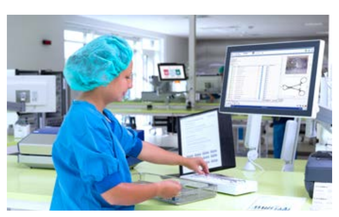
Ensure full traceability to patient with T-DOC.