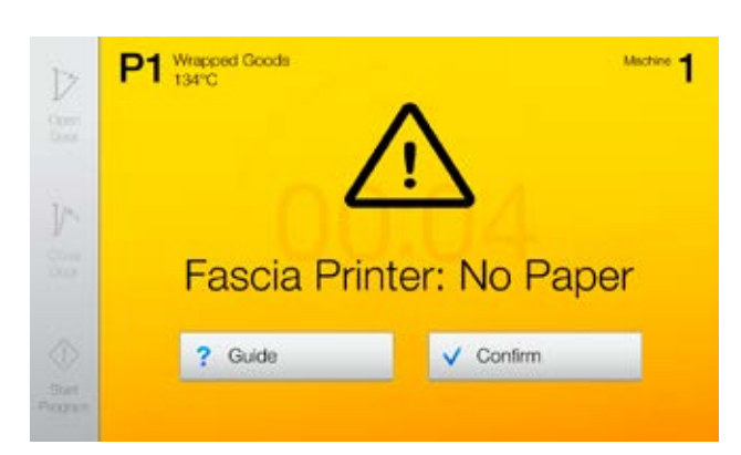
CENTRIC provides clear, easy-to-understand online help for problemsolving or accessing advanced features.

learn, trimming the time needed for training. And the clear, uncluttered data on goods and process status gives you the right information at the right time.