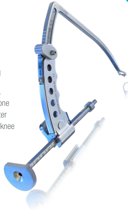
Infinity™ ACL Tibial Footprint Guide with All-Inside Guide Sleeve

Introducing the Infinity™ Knee System – one system with infinite possibilities.