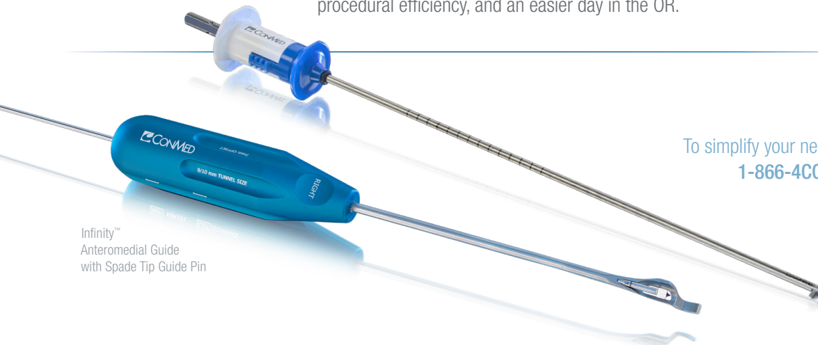
Infinity™ Anteromedial Guide with Spade Tip Guide Pin

We've partnered with a team of the world's most renowned knee surgeons, to develop products that overcome the challenges surgeons face in the OR every day. The result is a complete system designed to provide versatility, procedural efficiency, and an easier day in the OR.