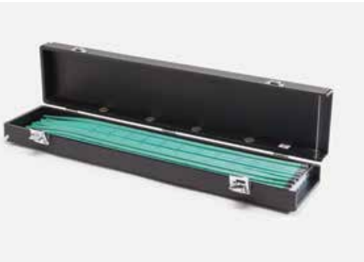
Store and transport WeightRight® Bougies in our storage case.