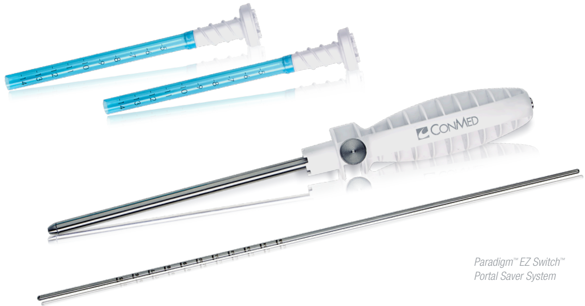
Paradigm™ EZ Switch™ Portal Saver System