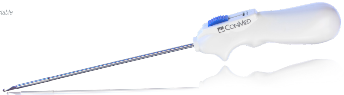
Paradigm™ Retractable Hook Blade