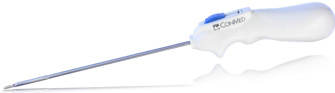
Paradigm™ Retractable Straight Blade